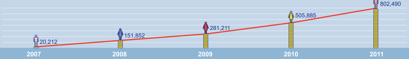
Cumulative Borrower Outreach 2007-2011 (estimation)

The Fund's premise is capital appreciation and, without sacrificing investment returns, contributing to the development of an inclusive financial sector in the developing world by providing capital needed to expand the positive impact of microfinance institutions in serving the financial needs of the lowest income households, who like anyone else, should have the right of access to loans, savings, insurance and other related products in order to run businesses, deal with risks, build assets and smooth income.